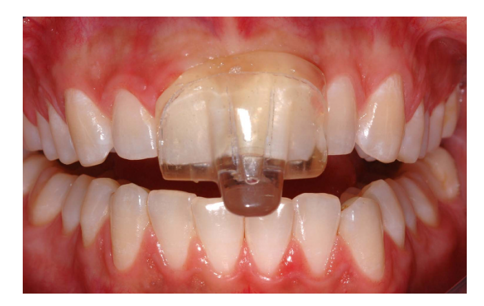
Figure 2 Inserted NTI-tss device.

possibility of unwanted side effects, such as aspiration, ingestion, occlusal changes after prolonged unmonitored use, and mobility of anterior teeth. In 2003, Helkimo [8] delivered an expert statement on demand of the Swedish Dental Association and the Swedish National Board of Health and Welfare on the question whether the use of the NTI-tss device "is to be regarded as lege artis and according to science and empirical experience, both as to the treatment of stomatognathic problems as well as migraine." The author came to the conclusion that there is a "total lack of scientific documentation of its therapeutic effects and possible unwanted side-effects" [8]. As far as side effects are concerned, Jokstad et al [10] mentioned that one person in Norway [13] and three individuals in the United States were subjected to medical emergencies due to aspirated NTI-tss devices splints. For the three cases from the U.S., the author referred to the FDA's Manufacturer and User Facility Device Experience Database (MAUDE), which contains voluntary, user facility, distributor, and manufacturer reports of adverse events involving medical devices. Later, Wright and Jundt [12] repeated the contention of four aspirated NTI-tss devices by referring Jokstad et al's article [10].