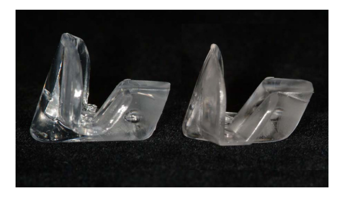
Figure I The NTI-tss device, standard type (left) and vertically reduced type (right).

Conversely, some renowned clinical researchers [e.g., [8-12]] have tempered over-optimistic expectations by raising doubts on the claimed success and by pointing at the