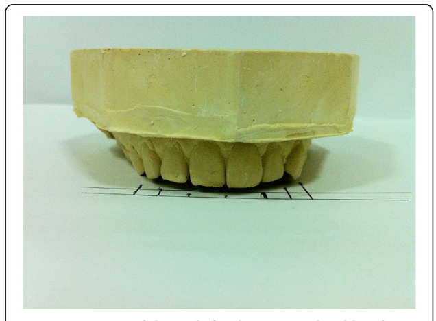
Figure 2 Drawing of the grids for the perceived widths of maxillary anterior teeth.

A one-sample t test was used to compare the width-to-height ratios of all tooth groups with the proportion