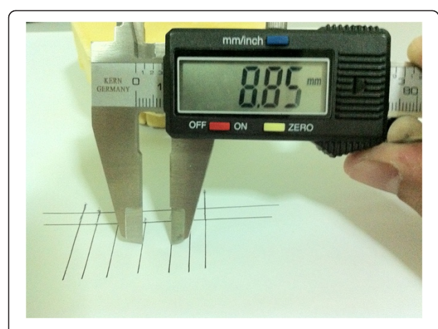
Figure 3 Taking measurements for the spaces in the golden proportion grid.

of 80% and to assess the incidence of the golden proportion of 0.618. One-way analysis of variance (ANOVA) was used to analyse the comparison among ethnics in the golden proportion and golden standards.