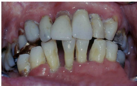
Fig. 2 Severe periodontitis in a patient

There are limitations to this study. The study design provided only association among the study variables and not on causality. Therefore, further research must be done before the potential for oral infections to cause damage in cirrhosis patients can be definitely established. In particular, longitudinal studies with repeated oral examinations and oral interventions studies would be valuable. In addition, the findings could to some extent be due to confounding variables, such as unmeasured socioeconomic conditions, as it is shown that lower socioeconomic groups have lack of oral health awareness and dental care [38]. The possible confounding by these conditions is worth investigating in future studies. Finally, our study comprised a broad spectrum of cirrhosis patients and may be seen as representative for a cirrhosis population, but still the study design may limit generalizability of the strength of the association to