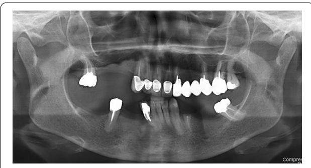
Fig. 1 Panoramic radiography at the first consultation negative for pathological bone imaging

The intraoral visual examination did not show any mucosal lesions; however, salivation was normal and the patient had no symptoms, especially pain or swelling. A thorough systematic physical examination was performed, with free bidigital palpation of the floor of the mouth and left cheek, but palpation of the right cheek revealed a submucosal infra-centimetric and irregular nodular lesion underneath the orifice of the Stenon canal (Fig. 2). It was not fixed to the deep plane and was of firm consistency. No cervical lymphadenopathy was found. In the context of monoclonal gammopathy, surgical excision of this nodule was performed under local anaesthesia, at the same operating time as the extraction of the residual root of the second right mandibular premolar. The excised tissue consisted of a brownish yellow tissue measuring 0.8\,\mathrm{cm} \times 0.7\,\mathrm{cm} \times 0.5\,\mathrm{cm} . On pathological examination, the lesion was firm and the cut surface yellowish-white. Microscopically, dense lymphomatous proliferation of the pseudo-nodular architecture was present,