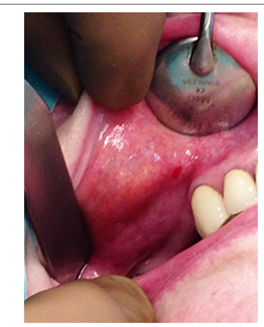
Fig. 2 Intraoral view of submucosal nodule of the right check

Hafian et al. BMC Oral Health (2021) 21:597 Page 3 of 10