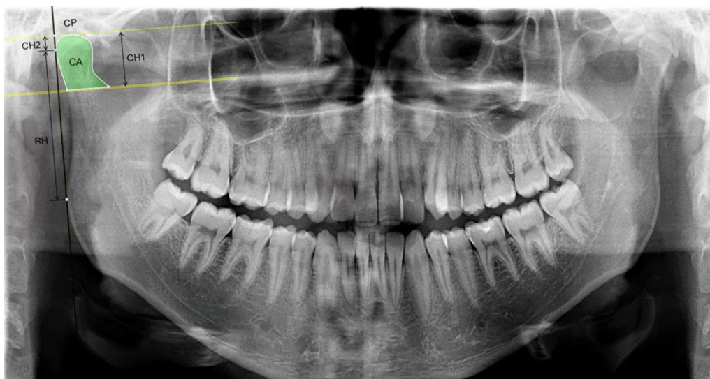
Fig. 2 Dental panoramic radiograph showing the selection of the condylar area (CA), the condylar perimeter (CP), the condylar height 1 (CH1), the condylar height 2 (CH2), the ramal height (RH) and the total height (CRH = CH2 + RH)