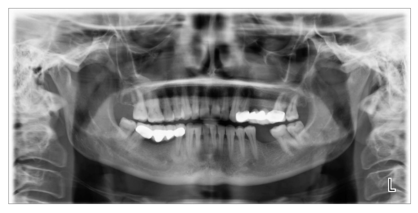
Fig. 3 A mixed lesion associated with the right lower first premolar in an RA patient

mandible. Four were in premolars, and twelve were in molars.