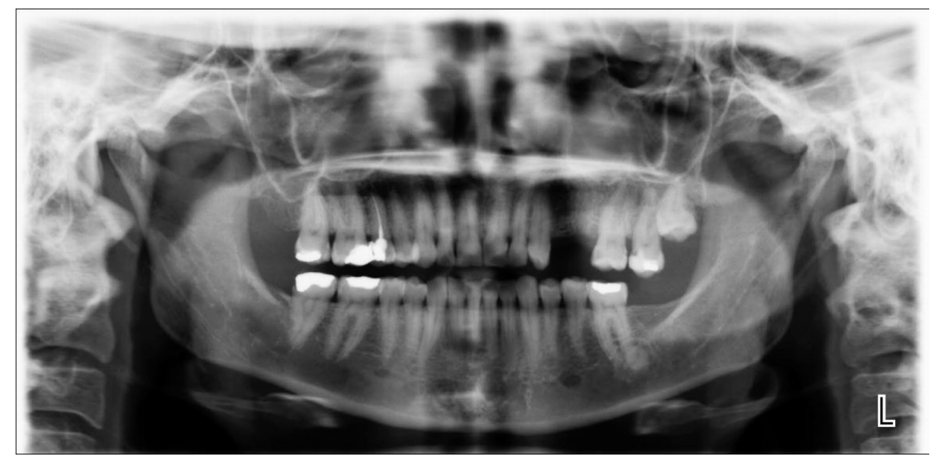
Fig. 2 A radiopaque lesion associated with the left lower first molar in an AS patient