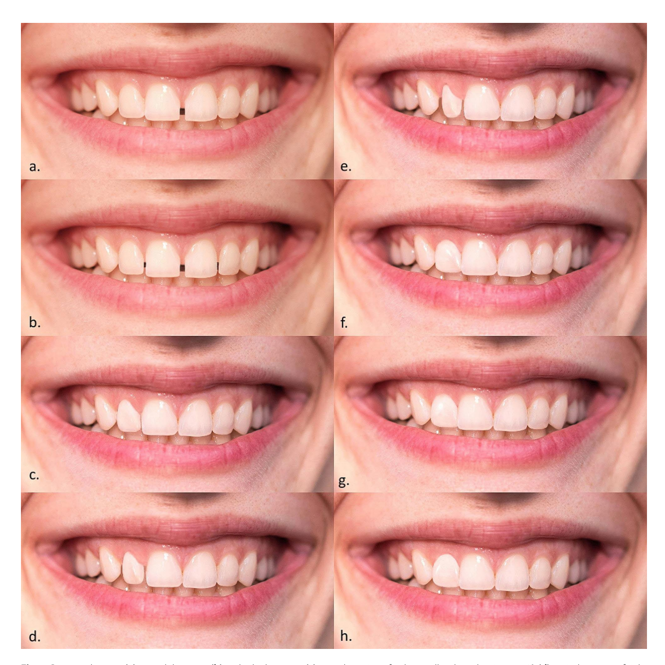
Fig. 4 Position changes: (a) central diastema; (b) multiple diastemas (c) typical rotation of right maxillary lateral incisors + 10°; (d) typical rotation of right maxillary lateral incisors + 20°; (e) typical rotation of right maxillary lateral incisors - 10°; (g) atypical rotation of right maxillary lateral incisors - 20°; (h) atypical rotation of right maxillary lateral incisors - 30°

Kovačić et al. BMC Oral Health (2024) 24:398 Page 6 of 13