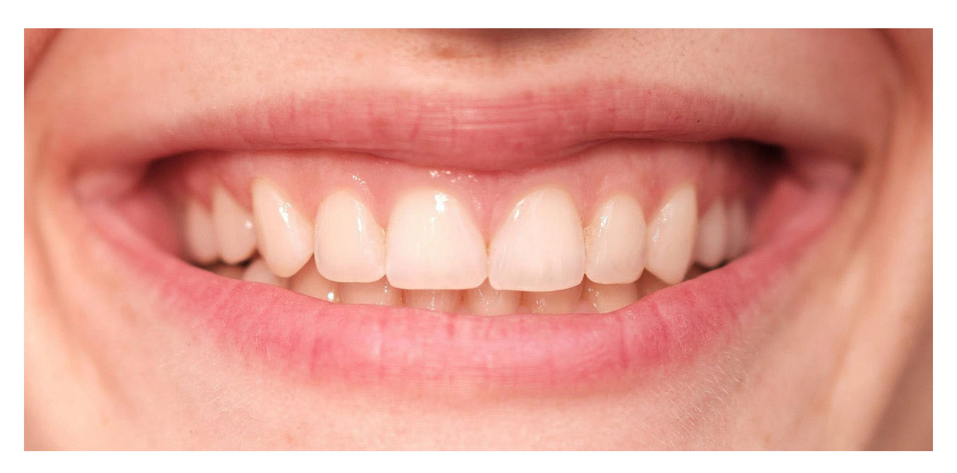
Fig. 1 Reference photograph

Kovačić et al. BMC Oral Health (2024) 24:398 Page 3 of 13