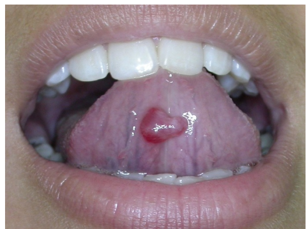
Figure 3 Mucocele of the gland of Blandin-Nuhn (ventral tongue). Pediculated turgid nodular lesion, measuring 3.0 cm in diameter.

When located on the ventral tongue, the differential diagnosis with lymphangioma must be considered. de Camargo Moraes et al.[19] state that mucocele of the