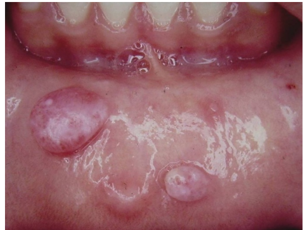
Figure 2 Turgid nodular lesions located on the lower lip.