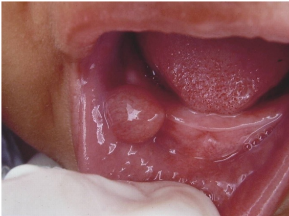
Figure 5 Turgid nodular lesion located on the lower lip of an infant.

In agreement with similar studies reported in the literature, in the present investigation 75.85% of the cases were diagnosed during the first and second decades of life, 49.42% of them during the second decade of life. Two