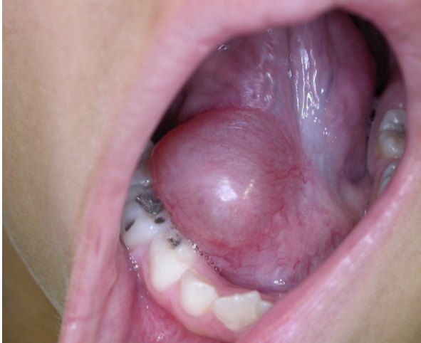
Figure 4 Asymptomatic turgid nodular lesion located on the floor of the mouth, measuring 4.0 cm in diameter.

gland of Blandin-Nuhn (ventral tongue) should not be considered rare. In their series, this type of mucocele was the second most frequent.