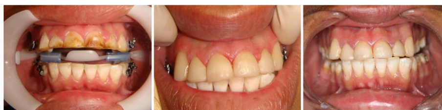
Figure 1 Teeth with severe fluorosis treated with direct resin aesthetic veneers (baseline, after treatment, and follow-up).

Table 2 depicts the prevalence changes observed between baseline and follow-up, highlighting the migration of participants from “no impact” conditions (sometimes, rarely, or never) to “with impact” (always or often) conditions. Of the 15 participants who had an impact at baseline, 11 had no impact after the aesthetic restorative treatment ( p = 0.006 ). Considering the prevalence of functional and psychosocial impact according to the OHIP-14 dimensions, there was a significant reduction in the prevalence of impact on the psychological discomfort