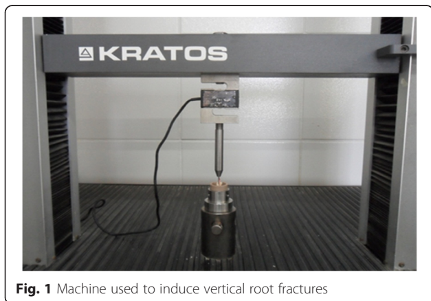
Fig. 1 Machine used to induce vertical root fractures

Periapical radiographs are not reliable methods for diagnosing VRFs [4, 7, 23]. Reliability is reduced further when the VRFs are present in teeth with gutta-percha or a metal post. Radiopaque material might appear as dark areas or