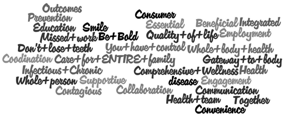
Fig. 2 Word Cloud Responses from the Poll Everywhere Question: "In one to three words, describe the most beneficial primary public message/communication when it comes to rural oral health"