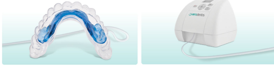
Fig. 1 A thermo-plastic mouthpiece with an integrated inflatable silicone element and the console

specifically designed for the subject and produced from orthodontic sheets by vacuum forming technology using CAD/CAM (computer-assisted design/computer assisted manufacturing) and 3D imaging.