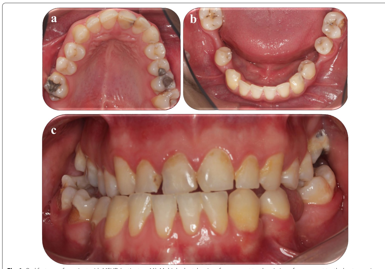
Fig. 1 Oral features of a patient with MSUD (patient no.11): Multiple dental caries of permanent teeth, missing of permanent teeth due to previous dental caries (a, b:26,34,36,45,46), marginal gingivitis of maxilla and presence of fistula in left lateral incisor (a), malocclusion, narrow palatal arch and posterior crossbite (a–c)

poor oral hygiene, heavy calculus formation, and severely decayed teeth could have possibly caused soft tissue and bone necrosis. Osteomyelitis is an uncommon but well-recognized complication of untreated odontogenic infection [27]. We did not encounter such a severe consequence of untreated caries in our patients.