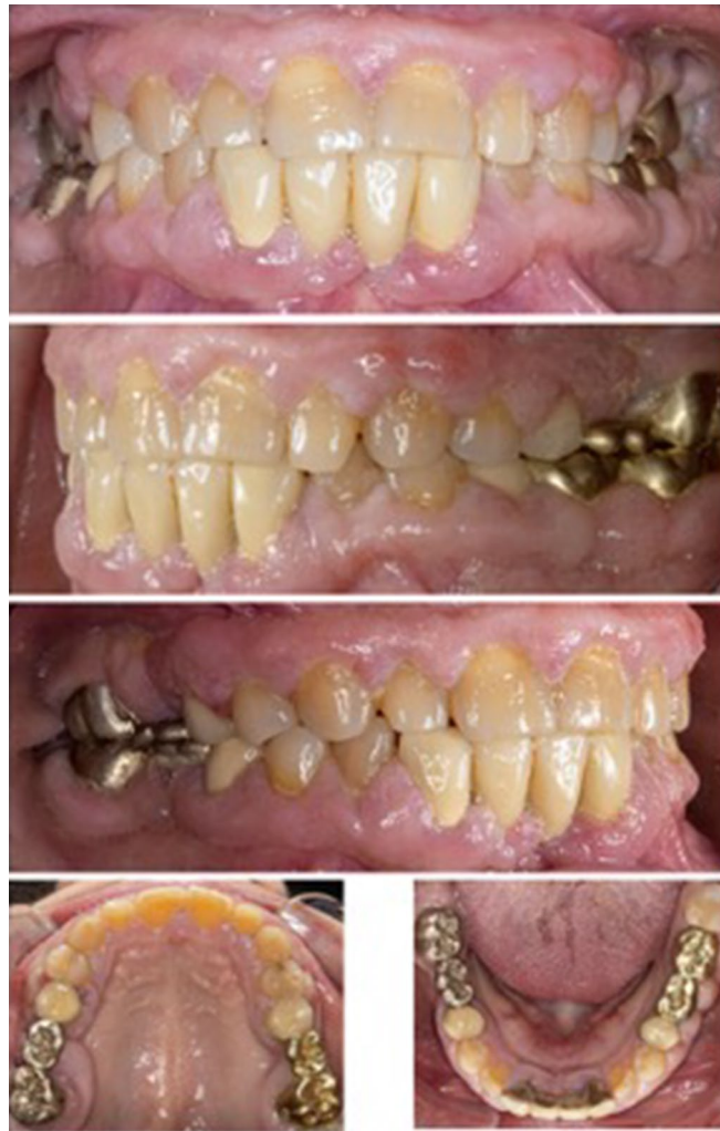
Fig. 2 Clinical case presentation of a female patient with a moderate gingiva hyperplasia due to cyclosporin medication

The successful treatment of inflammatory lesions represents a basic requirement before organ (re-) transplantation, in order to prevent a possible exacerbation of inflammation, with the risk of development of life-threatening abscesses during the drug-induced immunosuppression for organ transplantation. In the phase after organ transplantation, the non-inflammatory status must be maintained, since, in addition to a dreaded local spread of inflammation, a possible interruption of the drug-induced immunosuppression might become necessary in order to treat the abscess and ensure the survival of the patient. Any reduction of immunosuppression leads to an increase in immune competence, possibly resulting in transplant rejection and thus also endangering the patient's survival. In addition, persistent local inflammatory lesions can lead to an increased level of inflammatory mediators, which can have the systemic